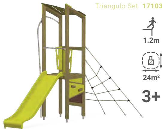
Triangulo Set 17103