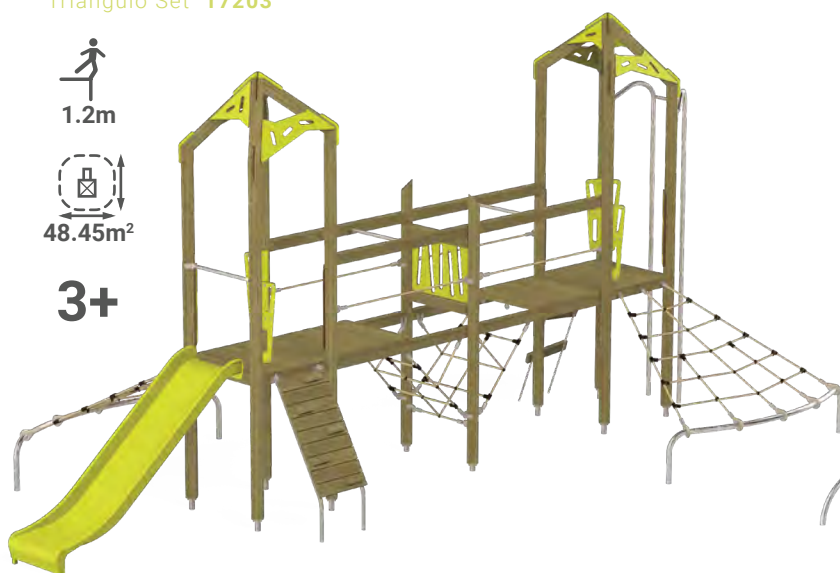
Triangulo Set 17203