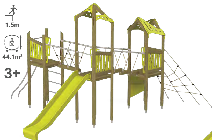
Triangulo Set 17302