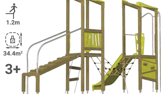
Triangulo Set 17202