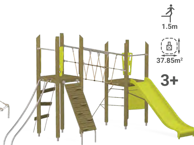
Triangulo Set 17201