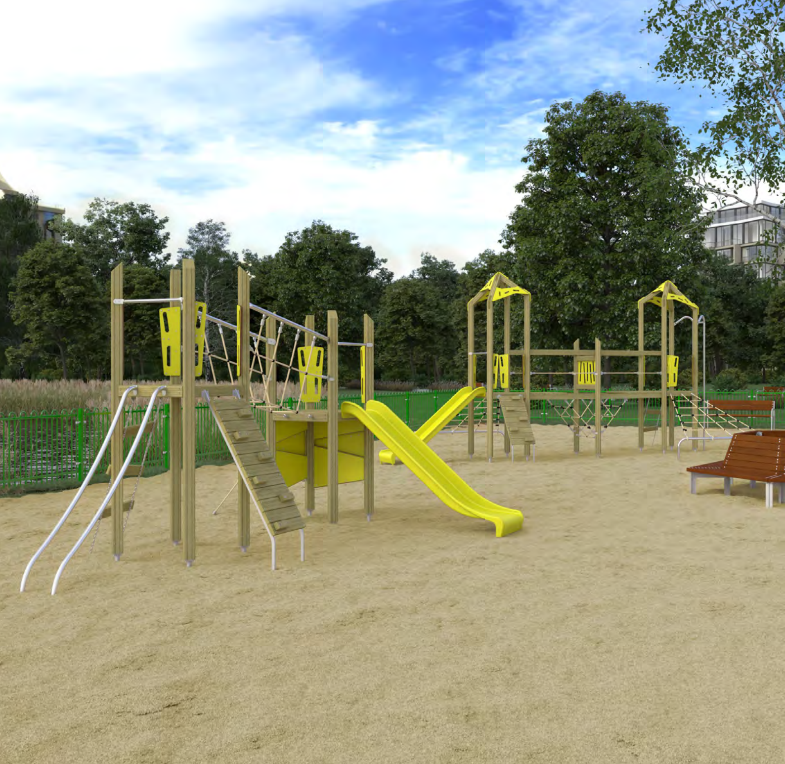
Triangulo Set 17101