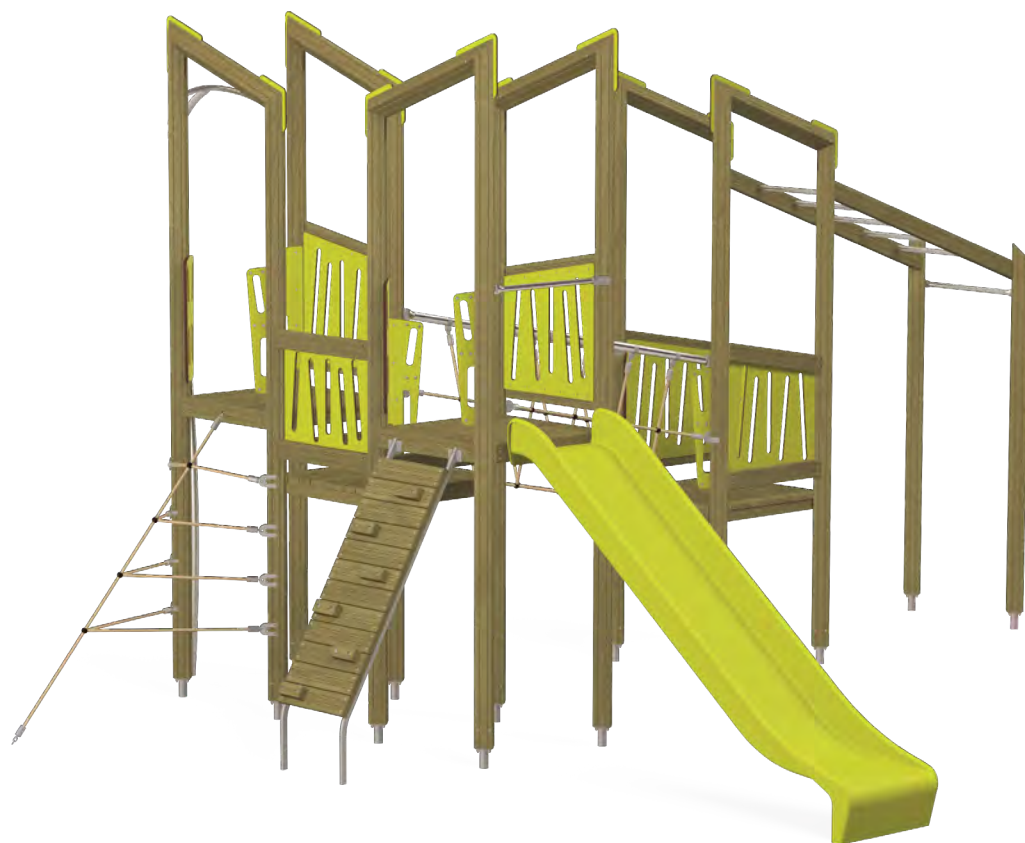
Triangulo Set 17401

More devices from the Triangulo collection can be found on our website www.novum4kids.com